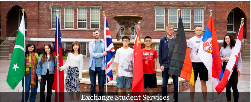
Exchange Student Services